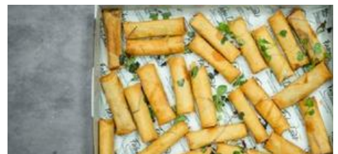
Tom yum prawn spring rolls (24 Pieces) $95