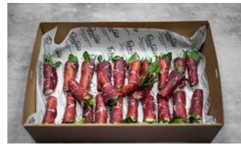
Beef bresola, pickled lemon, ricotta, Pelion dust (24 pieces) $10