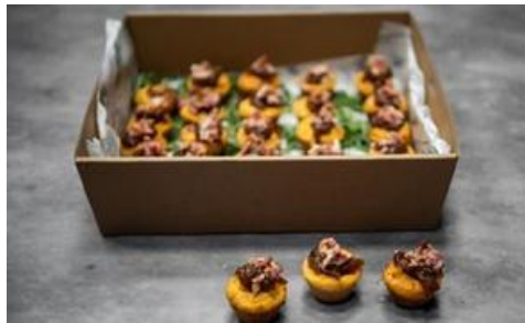
Corn fritters w caramelised onion & crispy bacon vege on req (24 pieces) $140