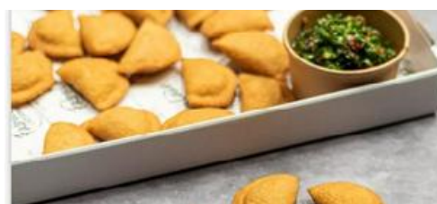
Empanada - Chorizo and Manchego (24 pieces) $95