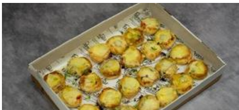
Margarita w pesto pizzette (24 pieces) $95