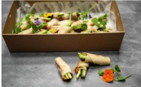
Peking duck pancakes, hoisin, spring onion, cucumber (24 pieces) $120