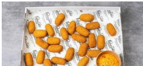
Mac n cheese croquettes Harissa aioli (24 Pieces) $95