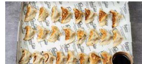
Gyoza Platter (24 pieces) $95