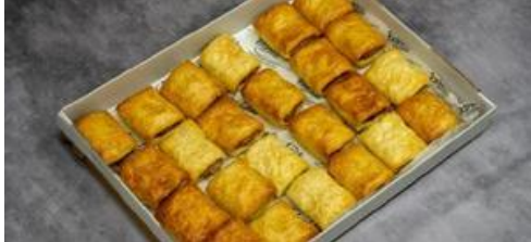
Beef and cheddar cocktail sausage rolls (24 pieces) $95

All boxes are 24 pieces of hand crafted canapes delivered already garnished ready to serve