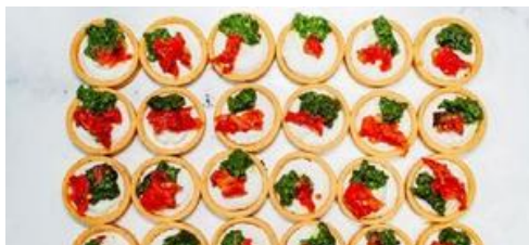
Goats cheese tartlet, semi dried tomato, salsa verde (v) (24 pieces) $99