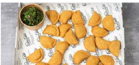
Empanada - Mexican Potato and Pea (24 pieces) $95