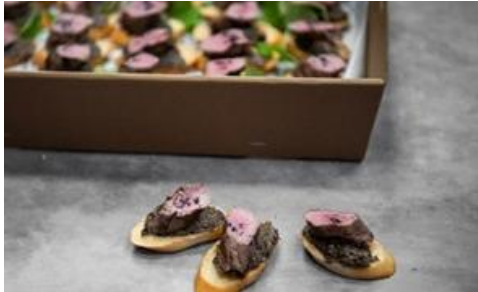
Peppered lamb fillet crostini, truffled mushroom pate (24 pieces) $120

All boxes are 24 pieces of hand crafted canapes delivered already garnished ready to serve