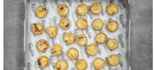
Caramelised red onion and cheddar tarts (24 pieces) $95