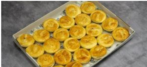
Mini cocktail beef pies (24 Pieces) $95