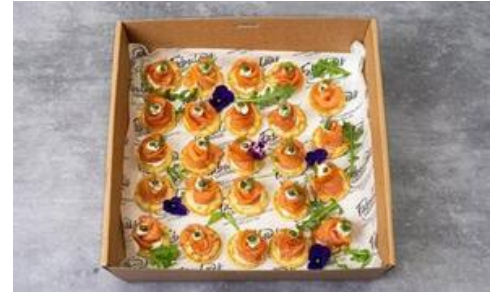
Cured salmon on mini pancake, citrus mascarpone (24 pieces) $110