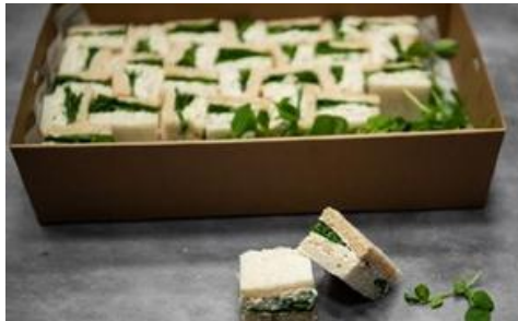
Coronation chicken pillow sandwiches (24 pieces) $95