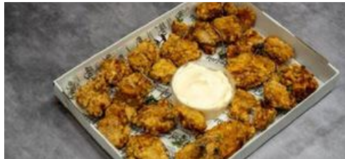
Karage Chicken, Kewpie Mayo (24 pieces) $95