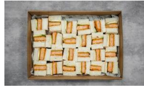
Crumbed prawn sando, shopann, plum sauce (24 pieces) $99