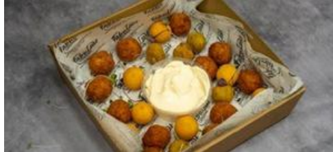
Box of seasonal arancini with dipping (24 Pieces) $95