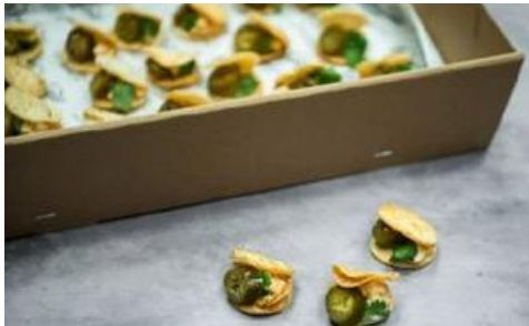
Lemon zaatar chook, Harissa yoghurt, pita (24 pieces) $99