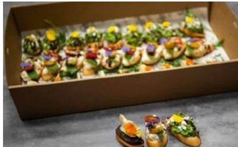
Bruschetta – 3 varieties of chef selection 3 flavours all vege (30 pieces) $99