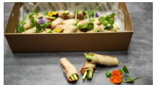
Peking duck pancakes, hoisin, spring onion, cucumber (24 Pieces) $120