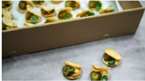
Lemon zaatar chook, harissa yoghurt, pita (24 Pieces) $99