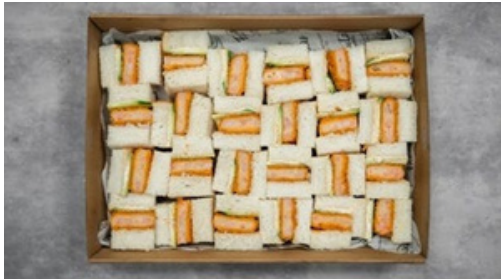
Crumbed prawn sando, shopann, plum sauce (24 pieces) $99

All boxes are 24 pieces of hand crafted canapes delivered already garnished ready to serve