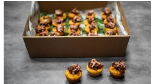
Corn fritters, caramelised onion, crispy bacon or vege on request (24 pieces) $140