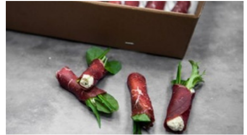
Beef bresaola, pickled lemon, ricotta, Pelion dust (24 Pieces) $110