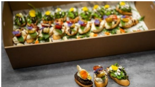
Bruschetta – our chef's selection of three vegetarian varieties (30 Pieces) $99