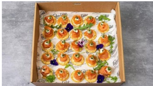
Cured salmon on mini pancake, citrus mascarpone (24 Pieces) $110