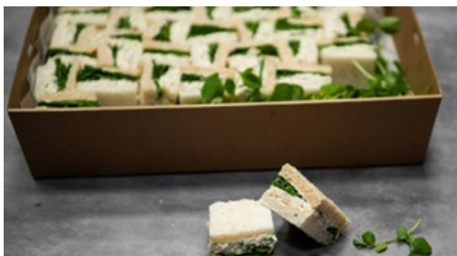
Coronation chicken pillow sandwiches (24 Pieces) $95