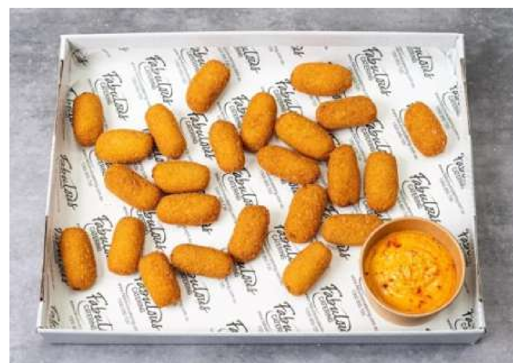
CROQUETTES BOX $95

Margarita with pesto pizzete (24 pieces)