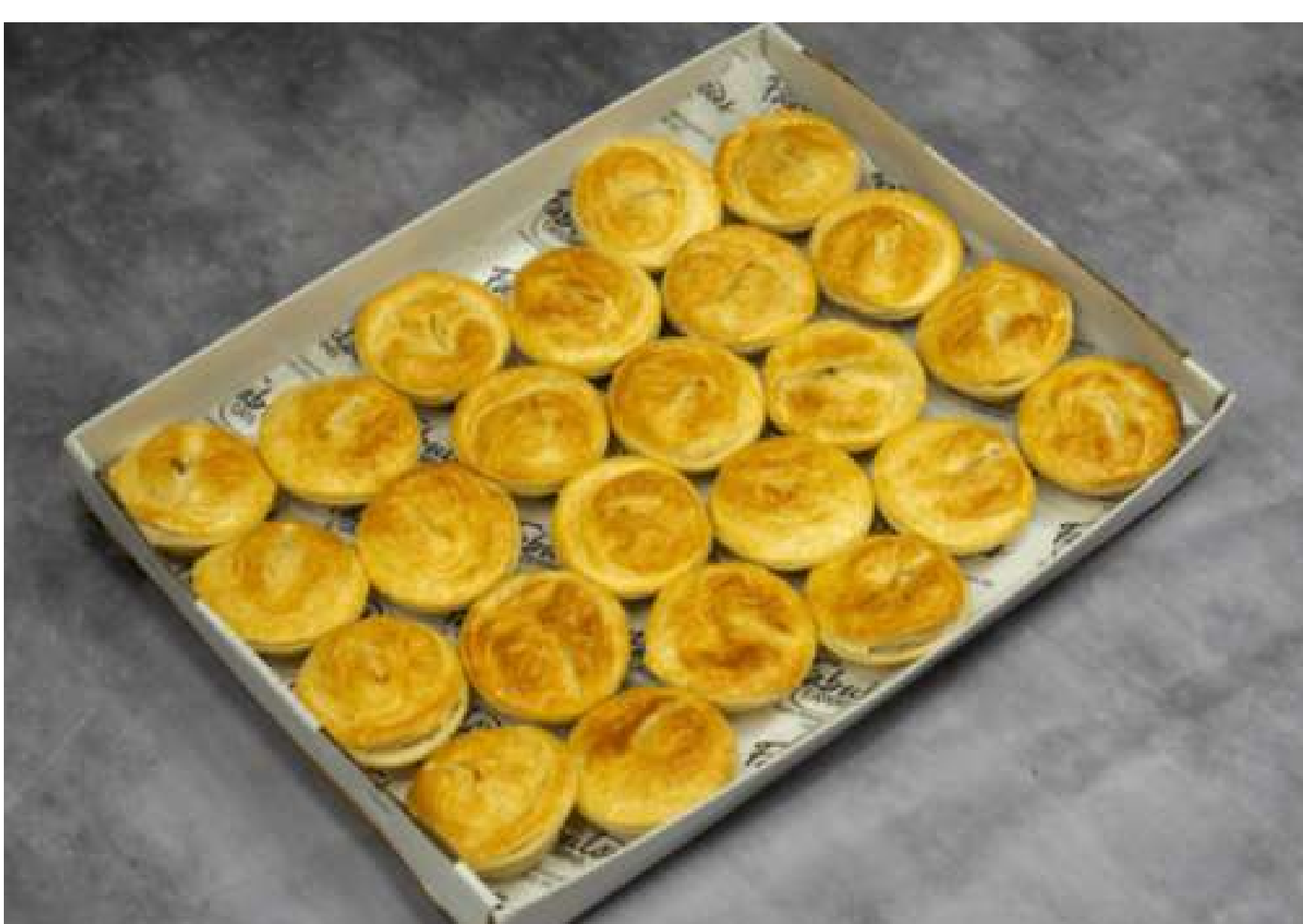
BEEF PIES BOX $95

Caramelised red onion and cheddar tarts (24 pieces)