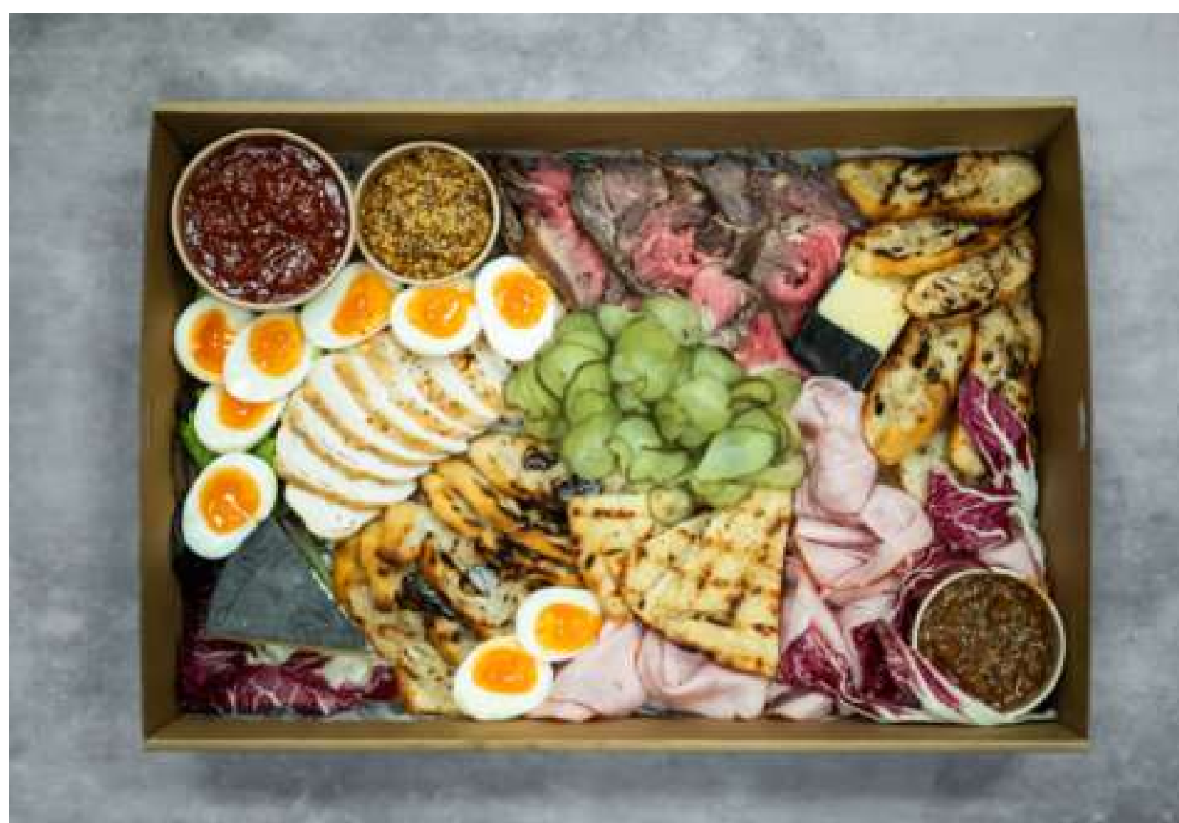
ENGLISH PICNIC BOX $129 - SERVES 10

A traditional ploughman's style platter of roast beef, smoked chicken, roast ham alongside aged cheddar, boiled eggs, pickles and freshly baked bread.