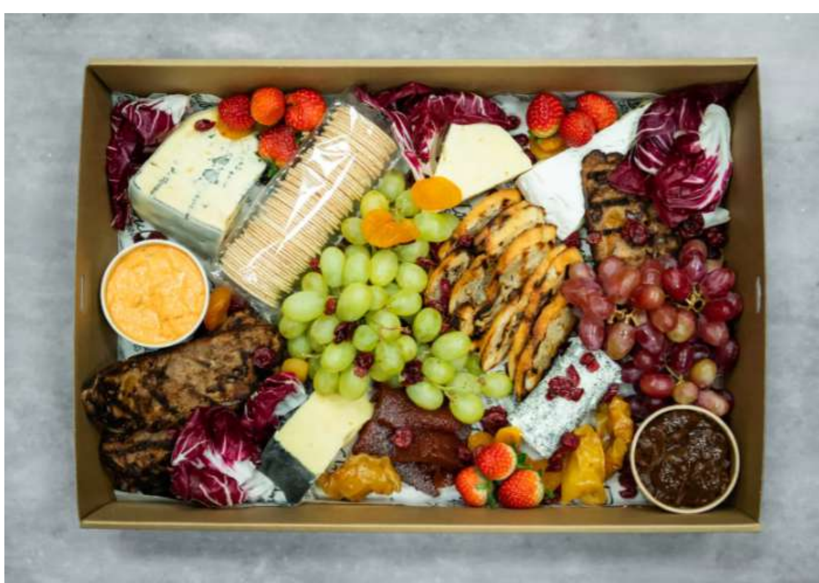
PREMIUM CHEESE SELECTION $99 - SERVES 10

A selection of food from the Middle East, vine leaves stuffed with rice, spiced lamb koftas, dates and goats cheese drizzled with ga honey and pistachios served with hummus babaganoush freshly baked Turkish pide and grilled pita.