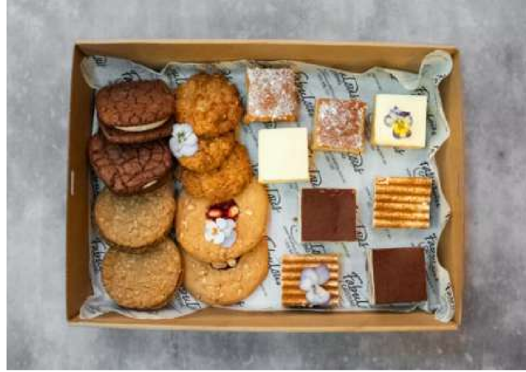
COOKIE AND SLICES BOX $85

Selection of 20 pastries including pies, tarts and sausage rolls.