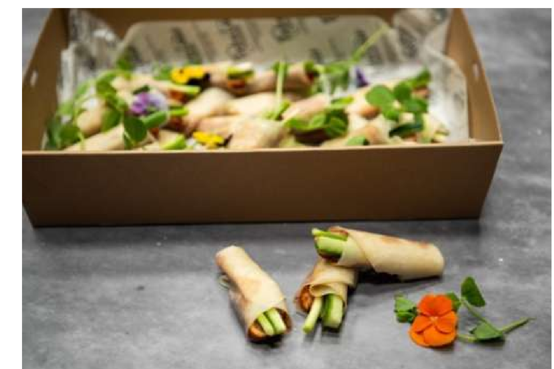
PEKING DUCK PANCAKES $120

Peppered lamb fillet crostini, truffled mushroom pate (24 pieces)