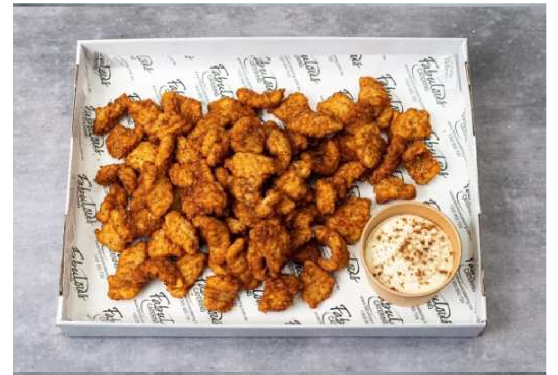
SQUID BOX $95