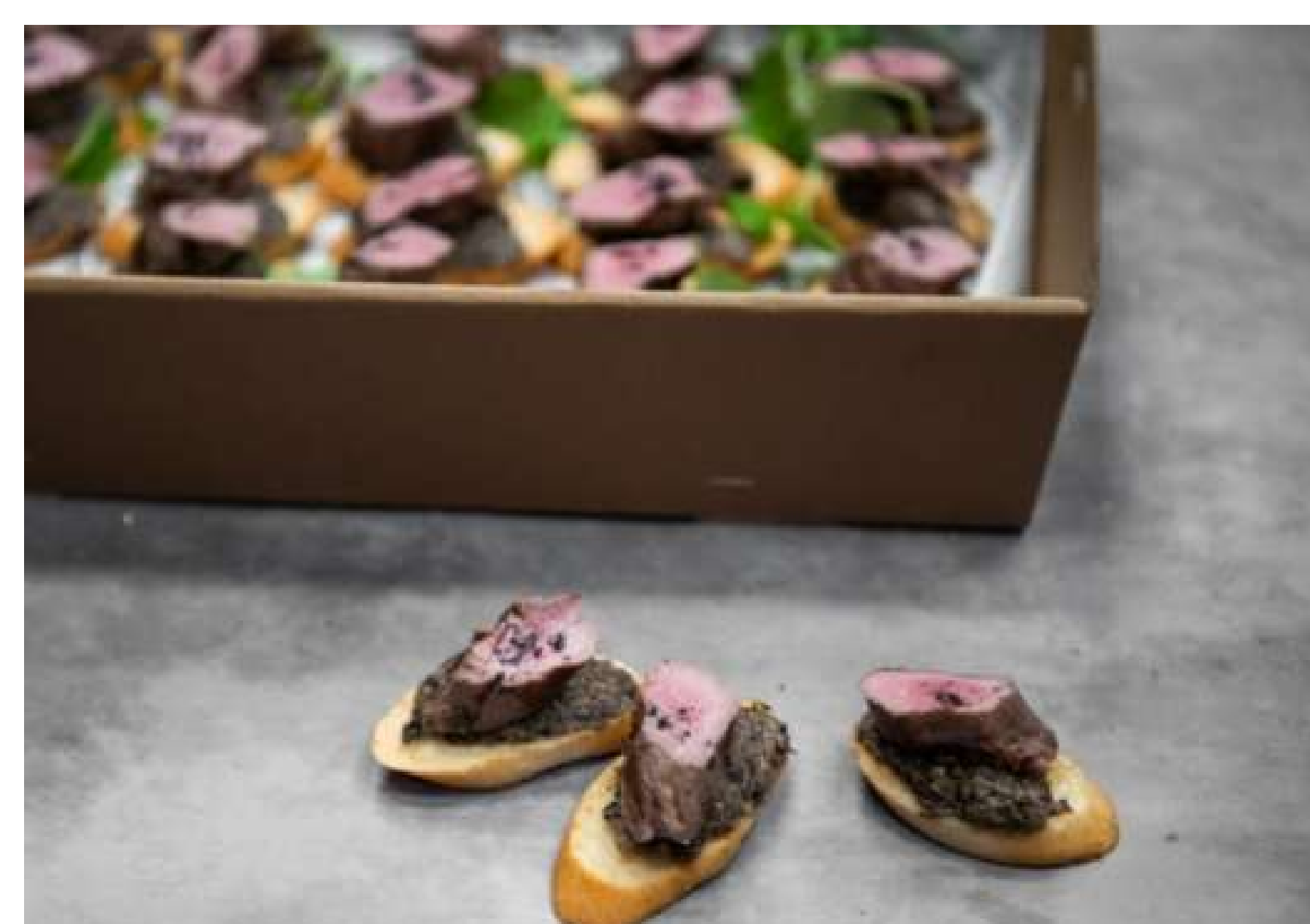
LAMB FILLET CROSTINI $120

Coronation chicken pillow sandwiches (24 pieces)