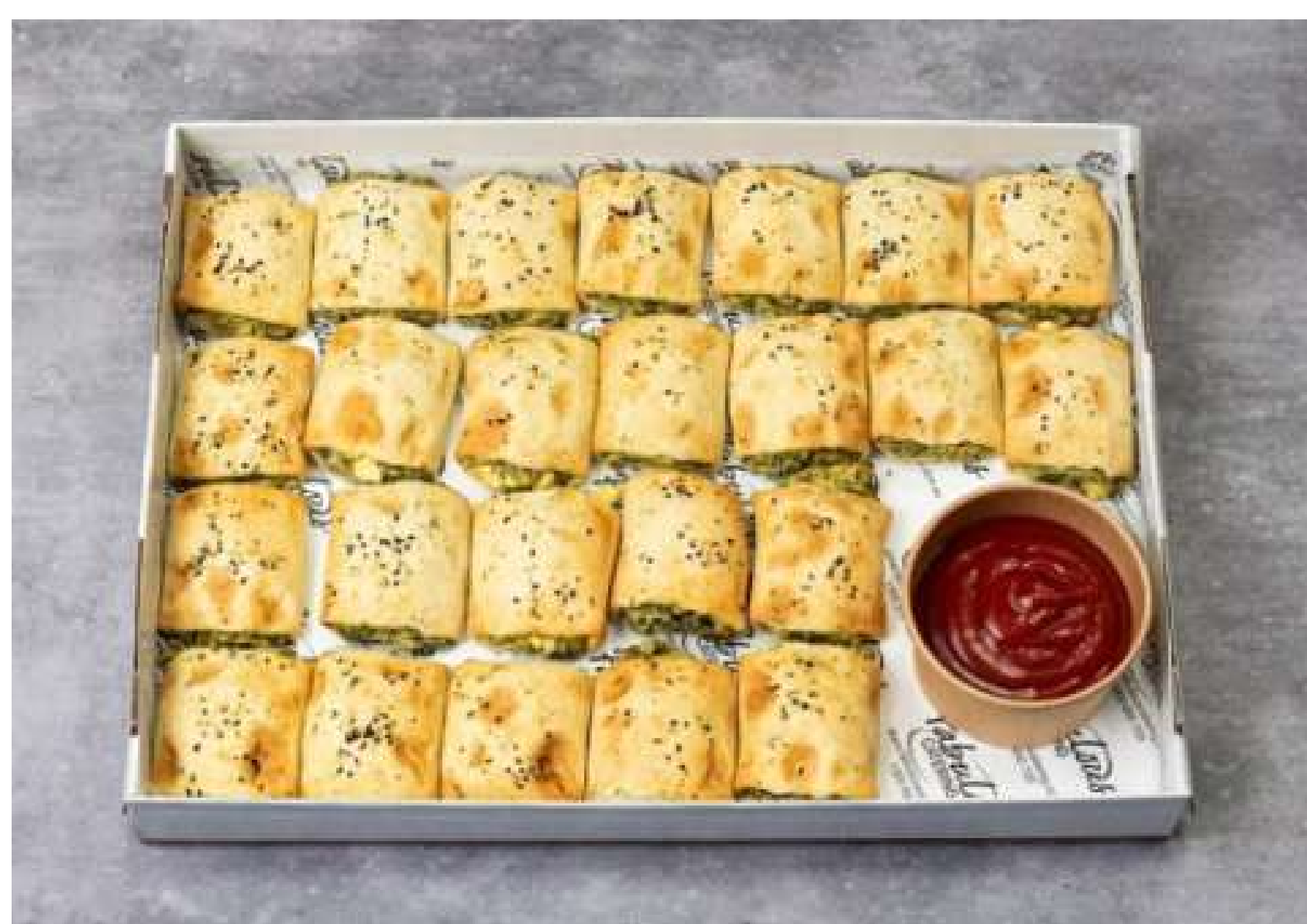
SPINACH ROLLS $95

Spinach and ricotta cocktail rolls (24 pieces)