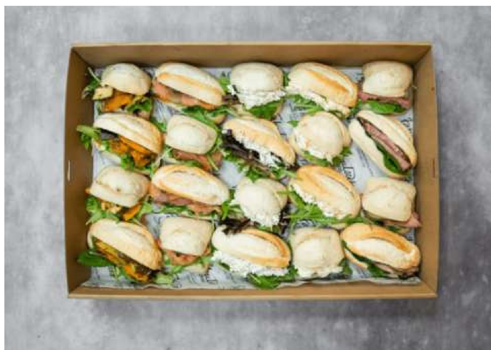
ROLLS BOX $105

25 assorted petite fours and sweet treats including truffles, macarons and mini cakes.