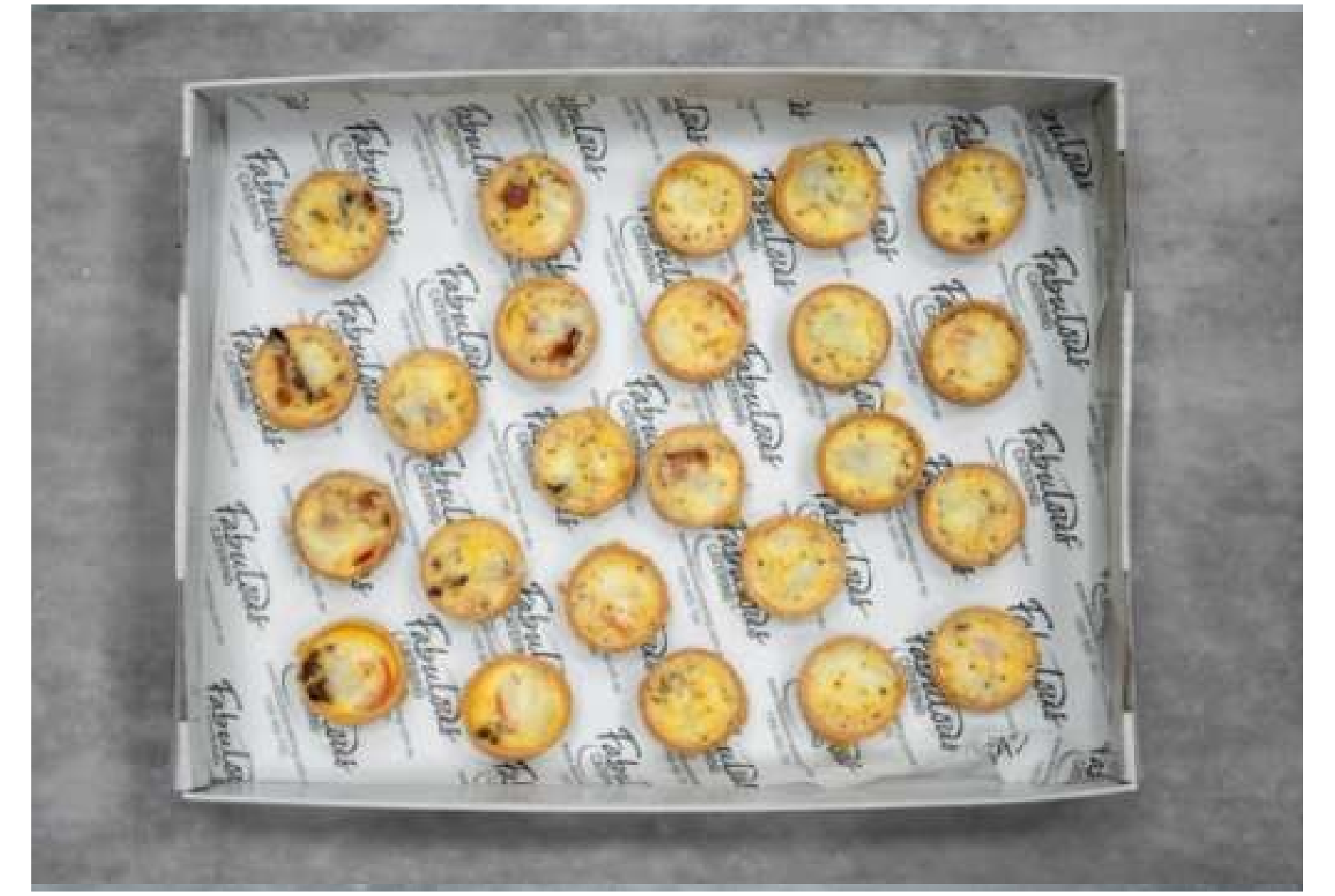
TARTS BOX $95

Box of seasonal arancini with dipping sauce (24 pieces)