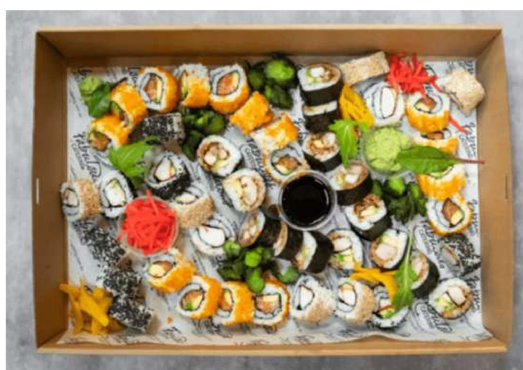
SUSHI BOX (48 PCS) $120

Selection of maki and nigiri pieces, soy, pickled ginger and wasabi.