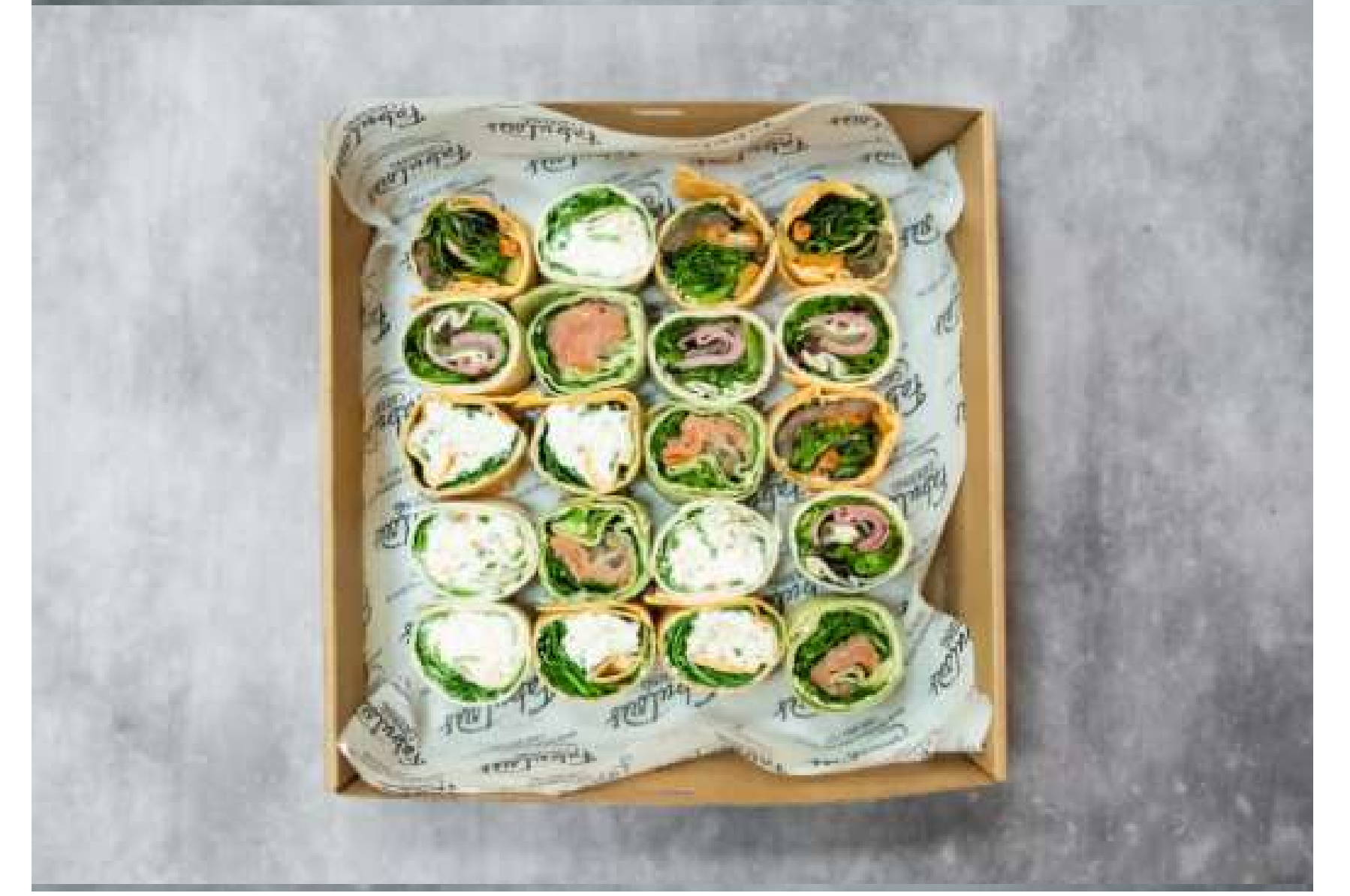
WRAP BOX $95

20 assorted cookies and slices straight from Fabulous kitchen.