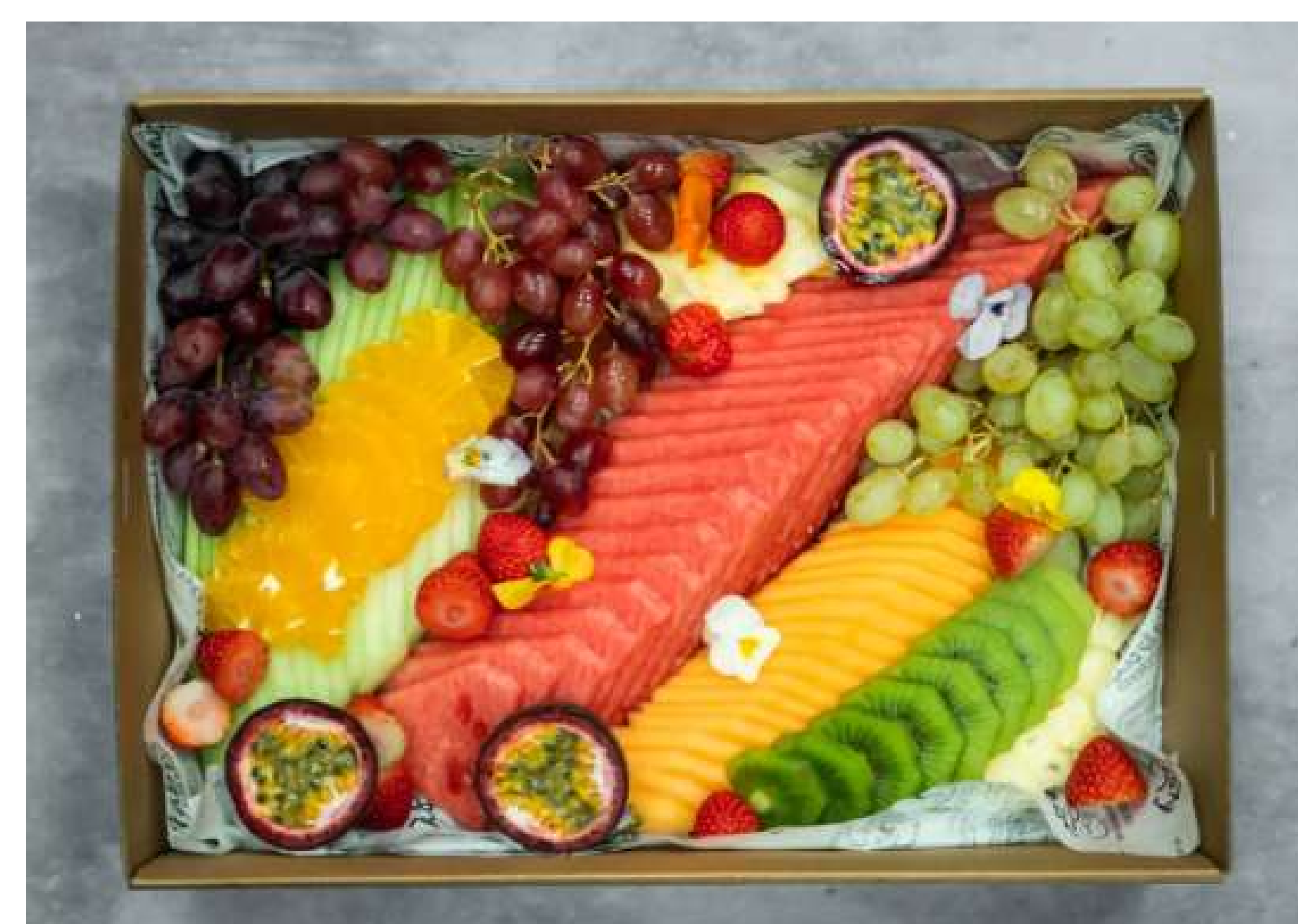
FRUIT PLATTER $89

Selection of 20 assorted sandwiches with chef's selection of fillings.