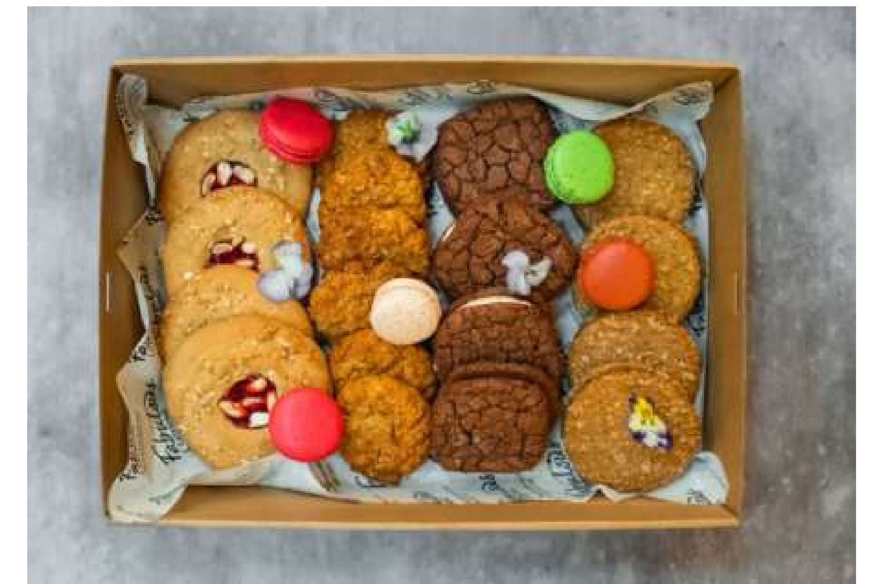
COOKIE BOX $80

Selection of 20 assorted rolls with chef's selection of fillings.