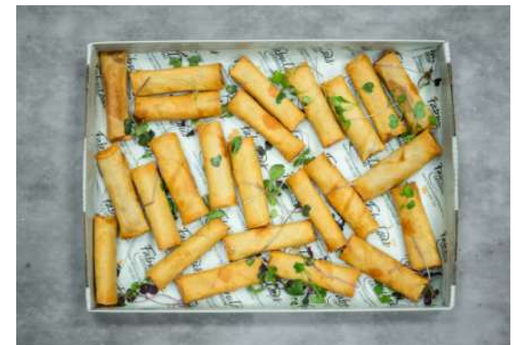
SPRING ROLLS BOX $95

Spinach and ricotta cocktail rolls (24 pieces)