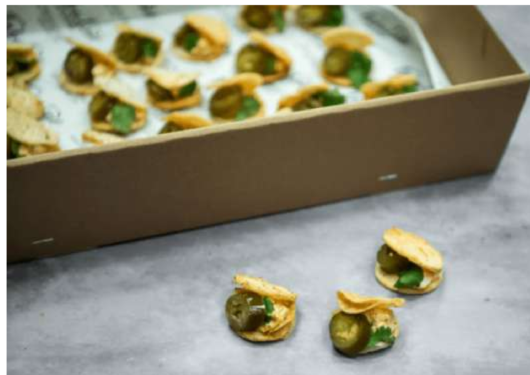
LEMON ZAATAR CHOOK $99

Crumbed prawn sando, shopann, plum sauce (24 pieces)