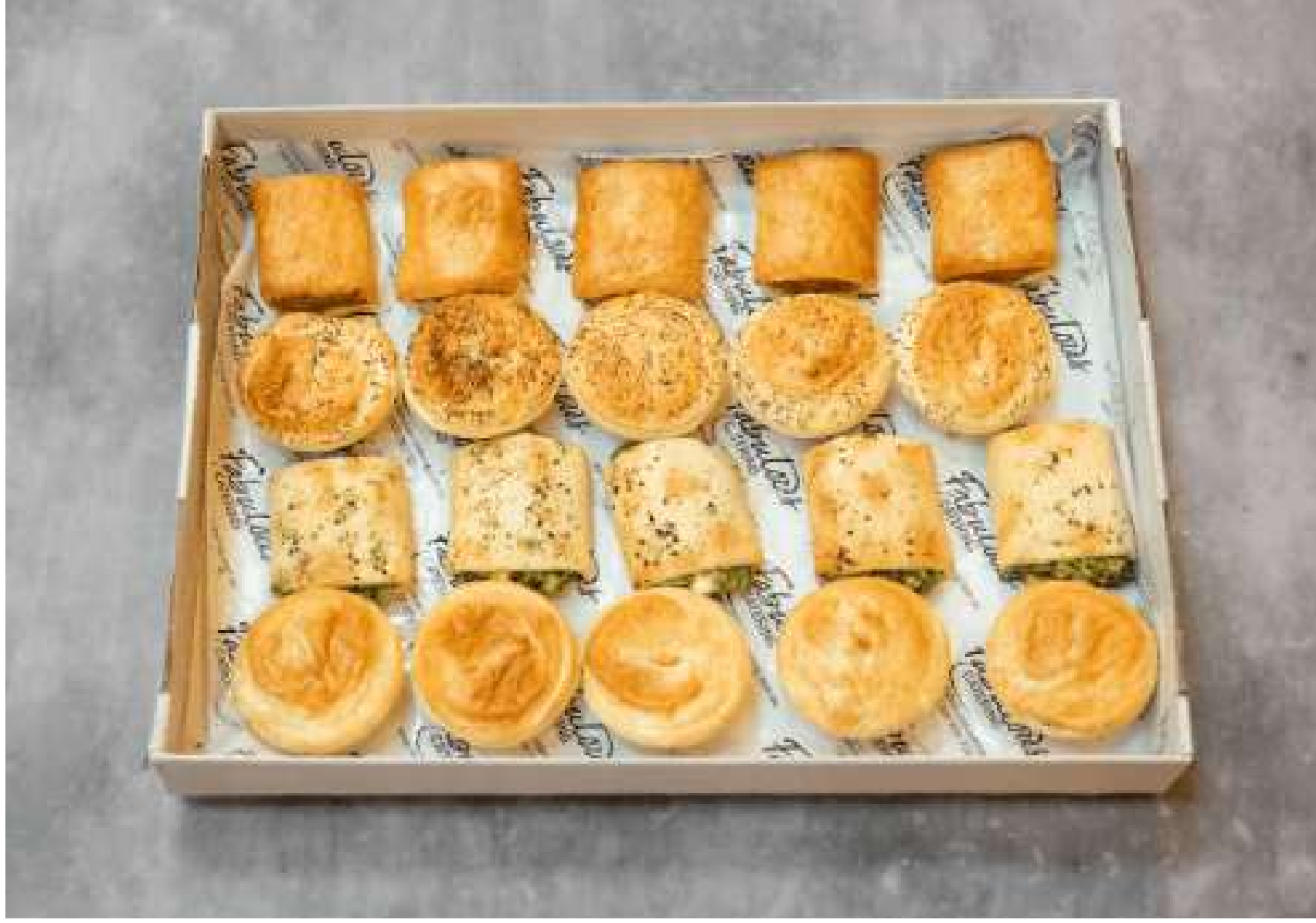
SAVOURY PASTRY BOX $100

Selection of 20 pastries including pies, tarts and sausage rolls.