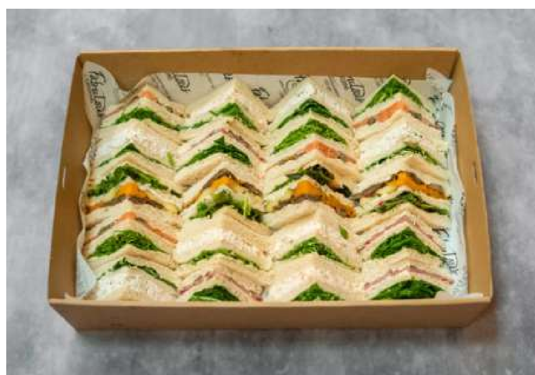
SANDWICH BOX $95

Selection of 20 assorted sandwiches with chef's selection of fillings.