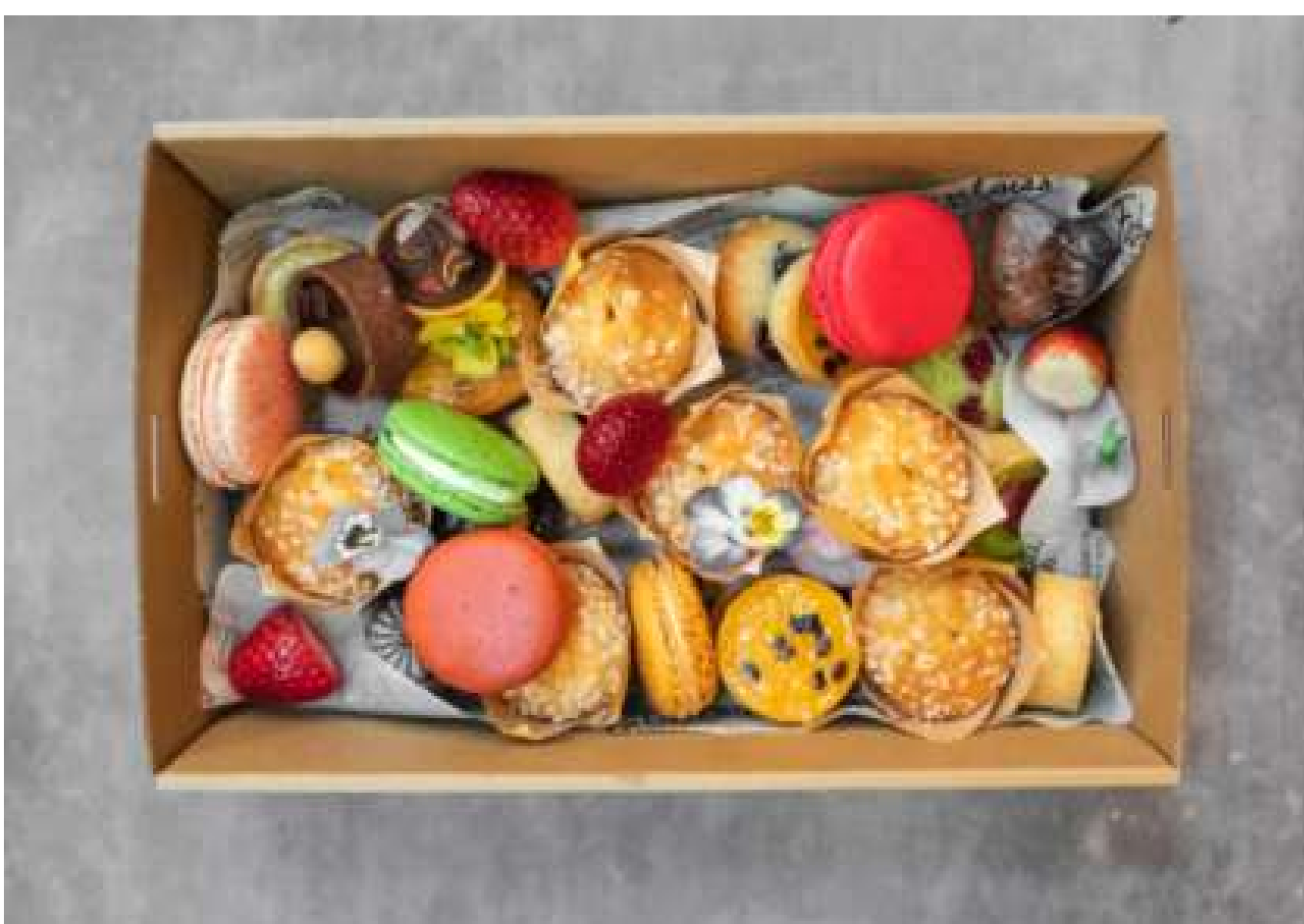
SWEET TREAT BOX $105

25 assorted petite fours and sweet treats including truffles, macarons and mini cakes.