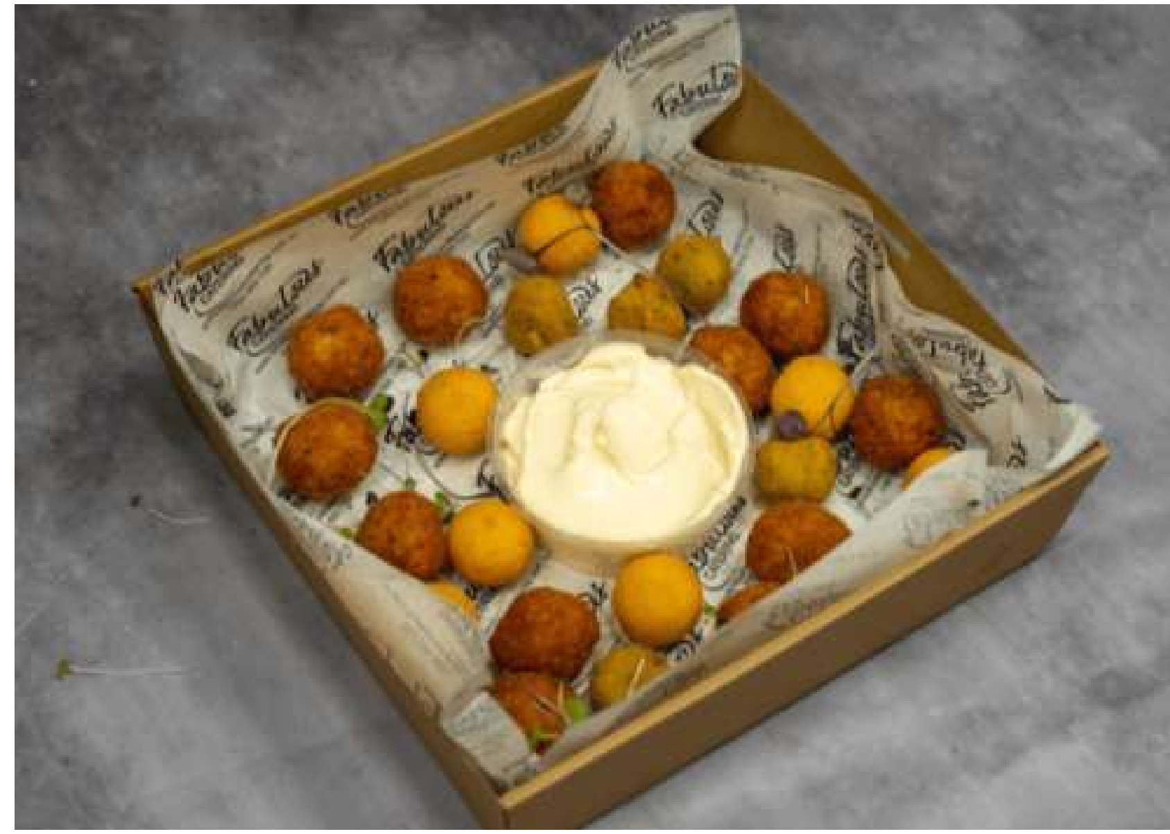
ARANCINI BOX $95

Beef and cheddar sausage rolls (24 pieces)