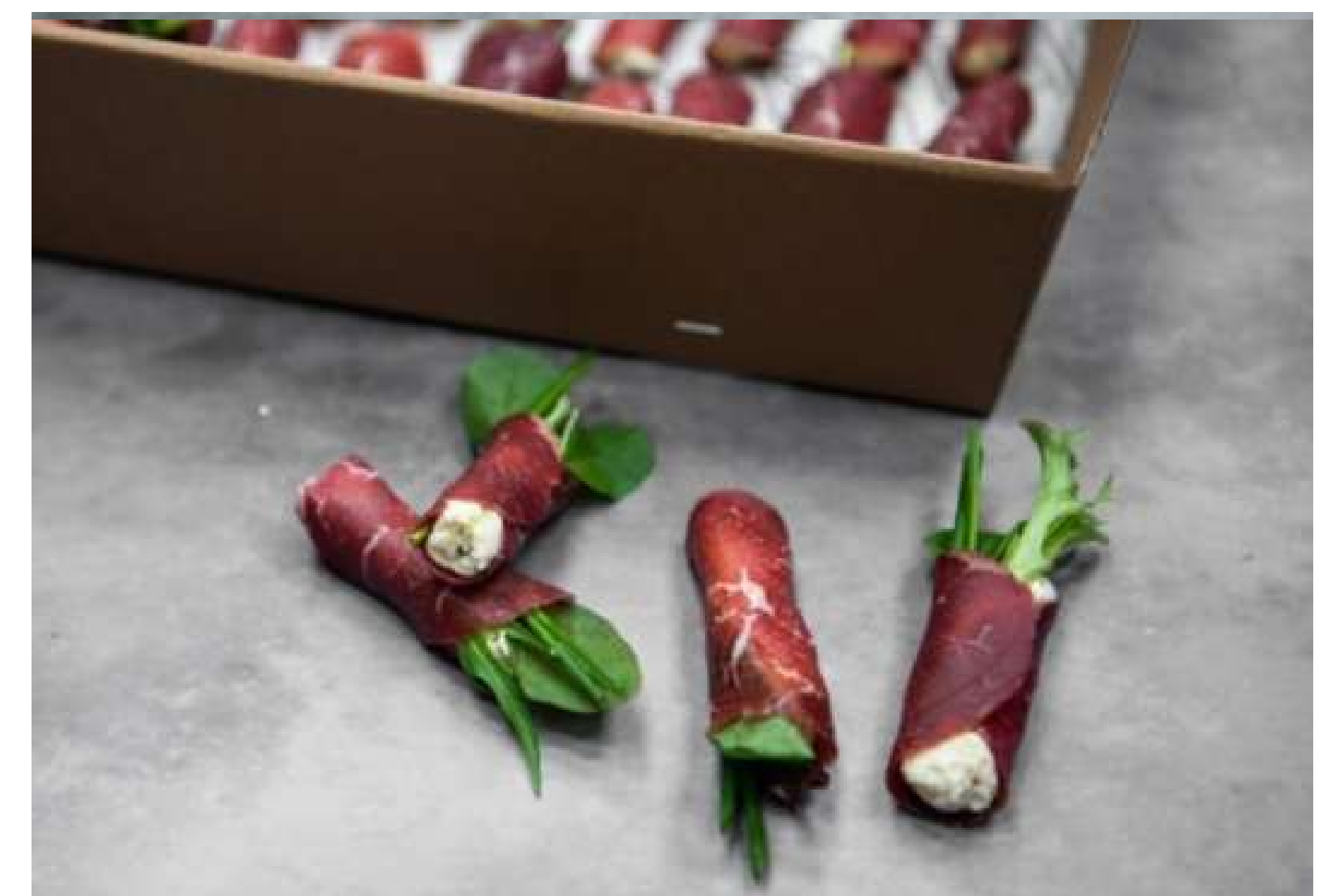
BEEF BREOLA $110

Lemon zaatar chook, harissa yoghurt, pita (24 pieces)