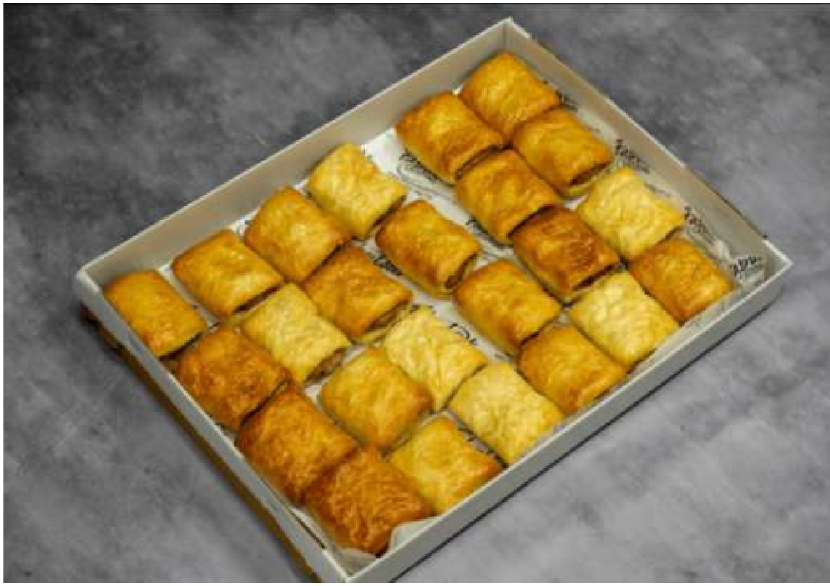
SAUSAGE ROLLS BOX $95

HANDCRAFTED CANAPES DELIVERED ALREADY GARNISHED AND READY TO SERVE