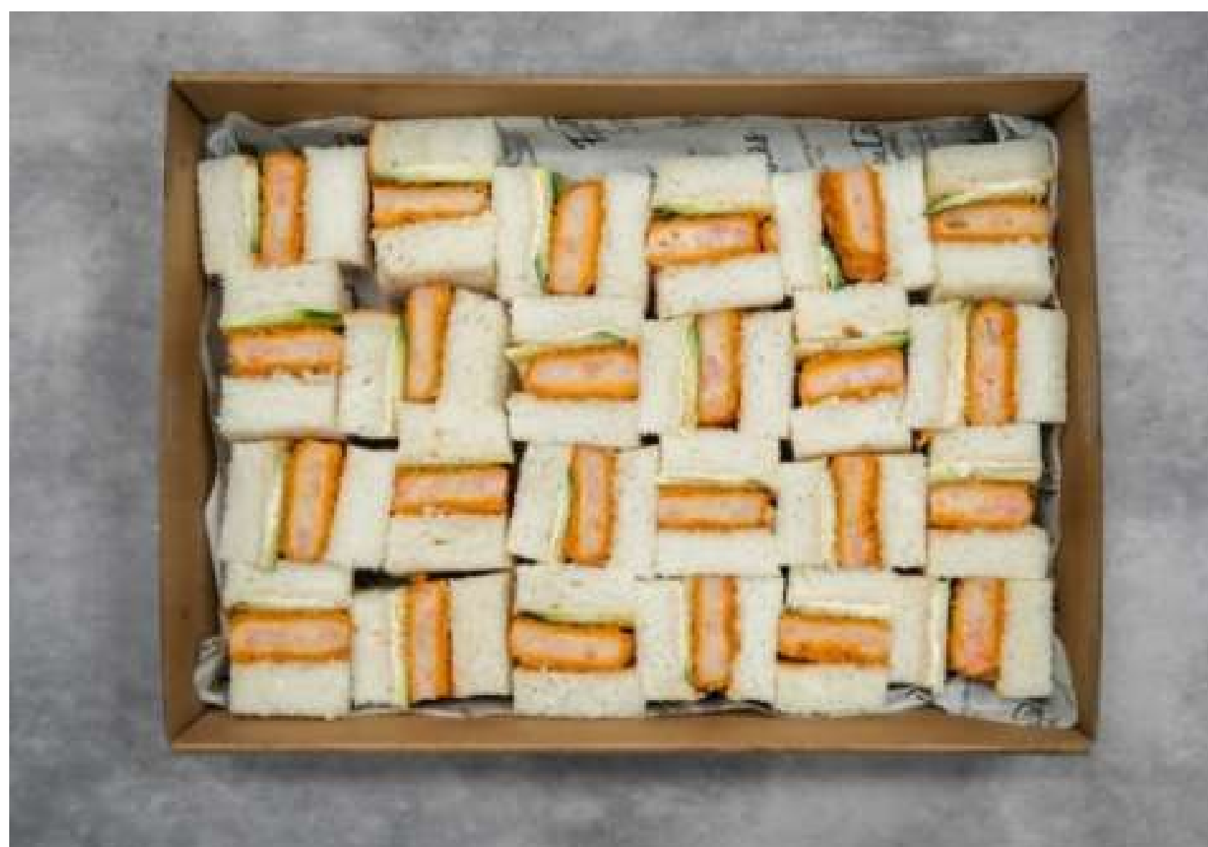
PRAWN SANDO $99

HANDCRAFTED CANAPES DELIVERED ALREADY GARNISHED AND READY TO SERVE