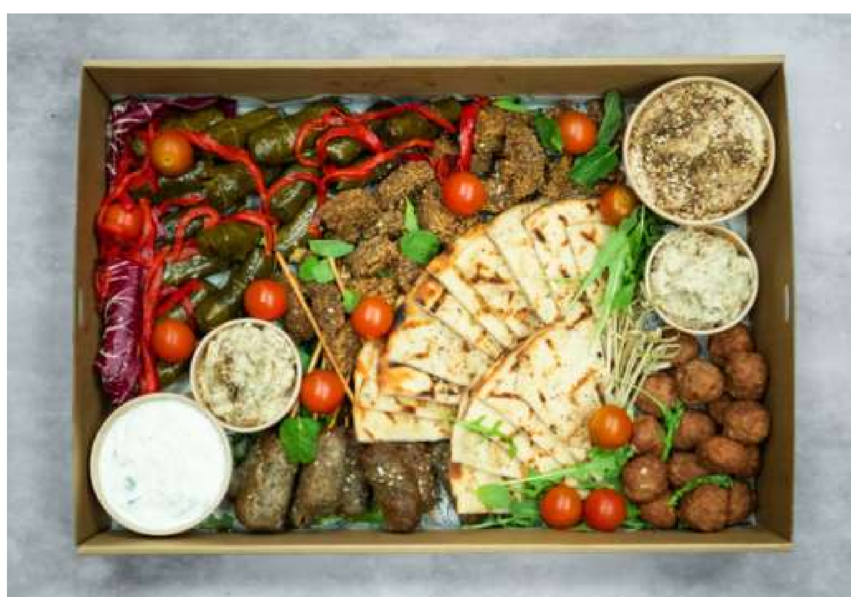
MIDDLE EASTERN PLATTER $129 - SERVES 10

Selection of charcuterie and antipasti including prosciutto crude, and salami Milano, marinated feta, local cheeses, Sicilian olives and stuffed pepper dews with bread and crackers.