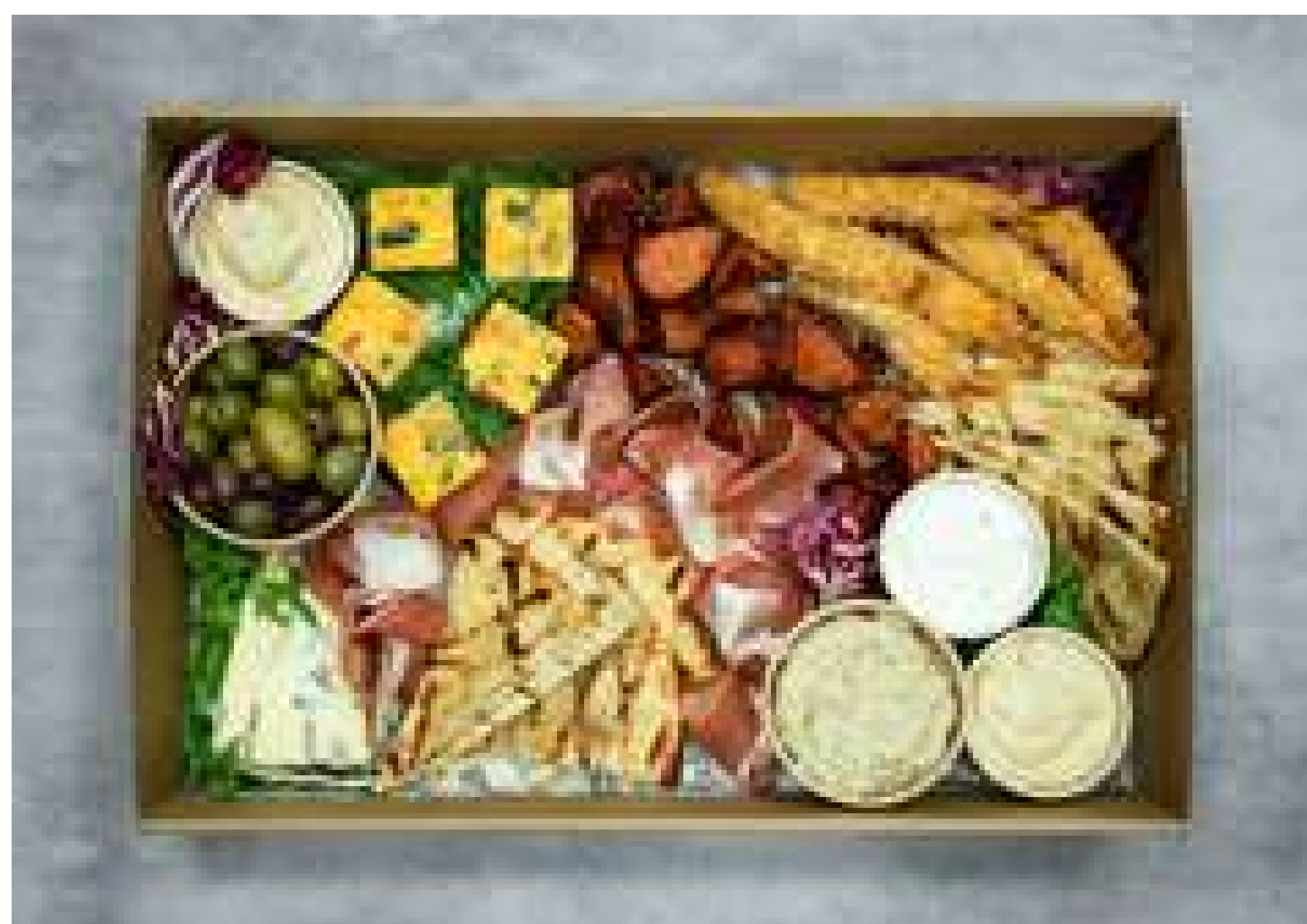
SPANISH TAPAS BOX $129 - SERVES 10

A traditional ploughman's style platter of roast beef, smoked chicken, roast ham alongside aged cheddar, boiled eggs, pickles and freshly baked bread.