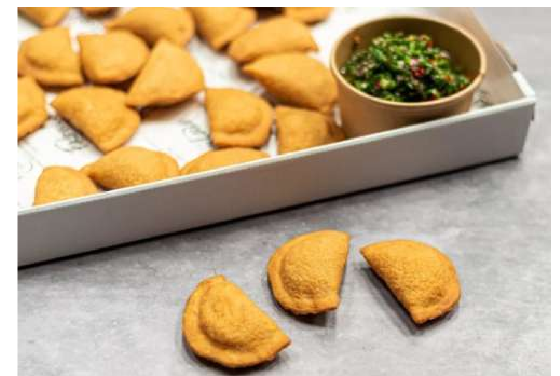
CHORIZO EMPANADA BOX $95

Chorizo and machego empanadas (24 pieces)