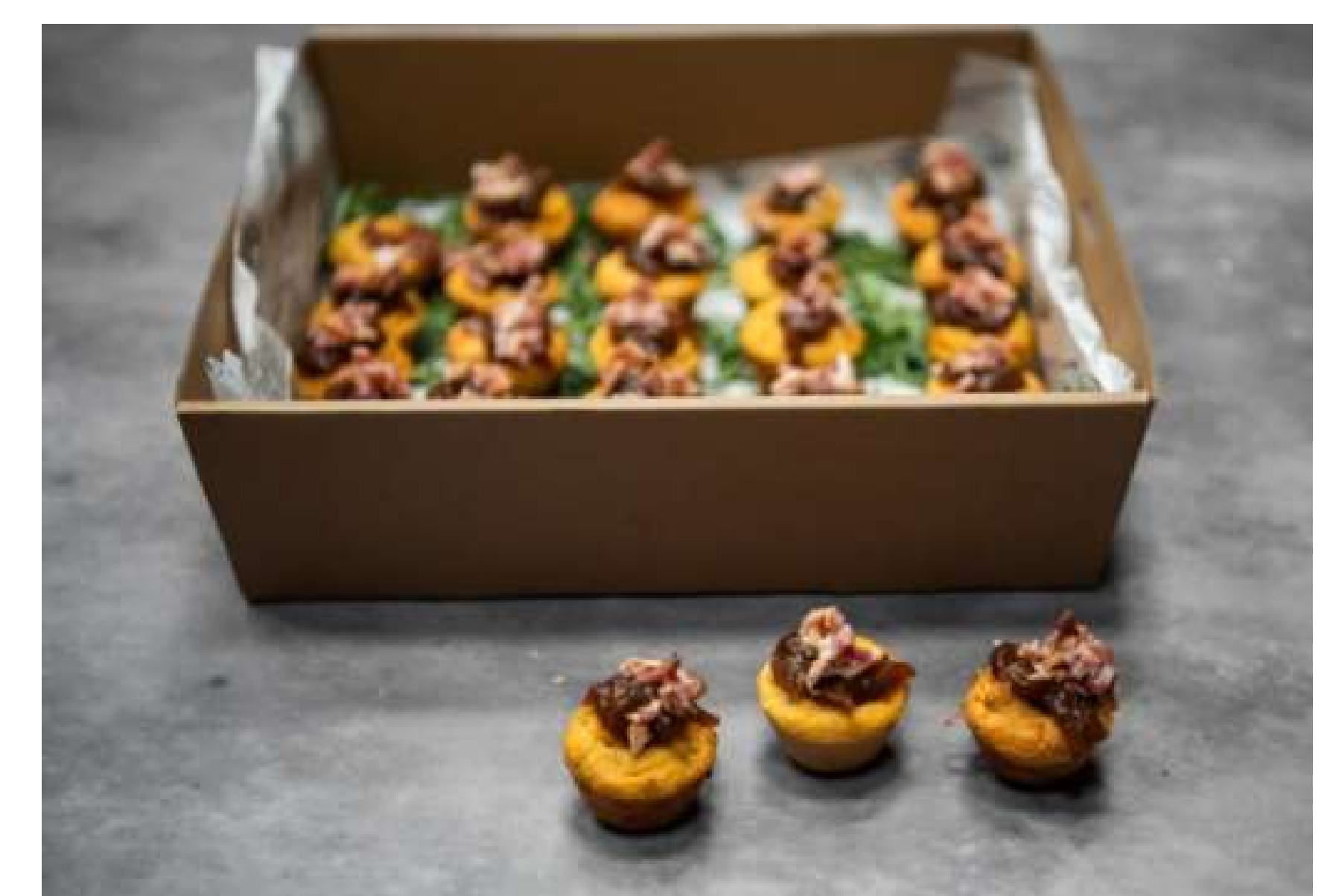
CORN FRITTERS $140

Cured salmon on mini pancake, citrus mascarpone (24 pieces)