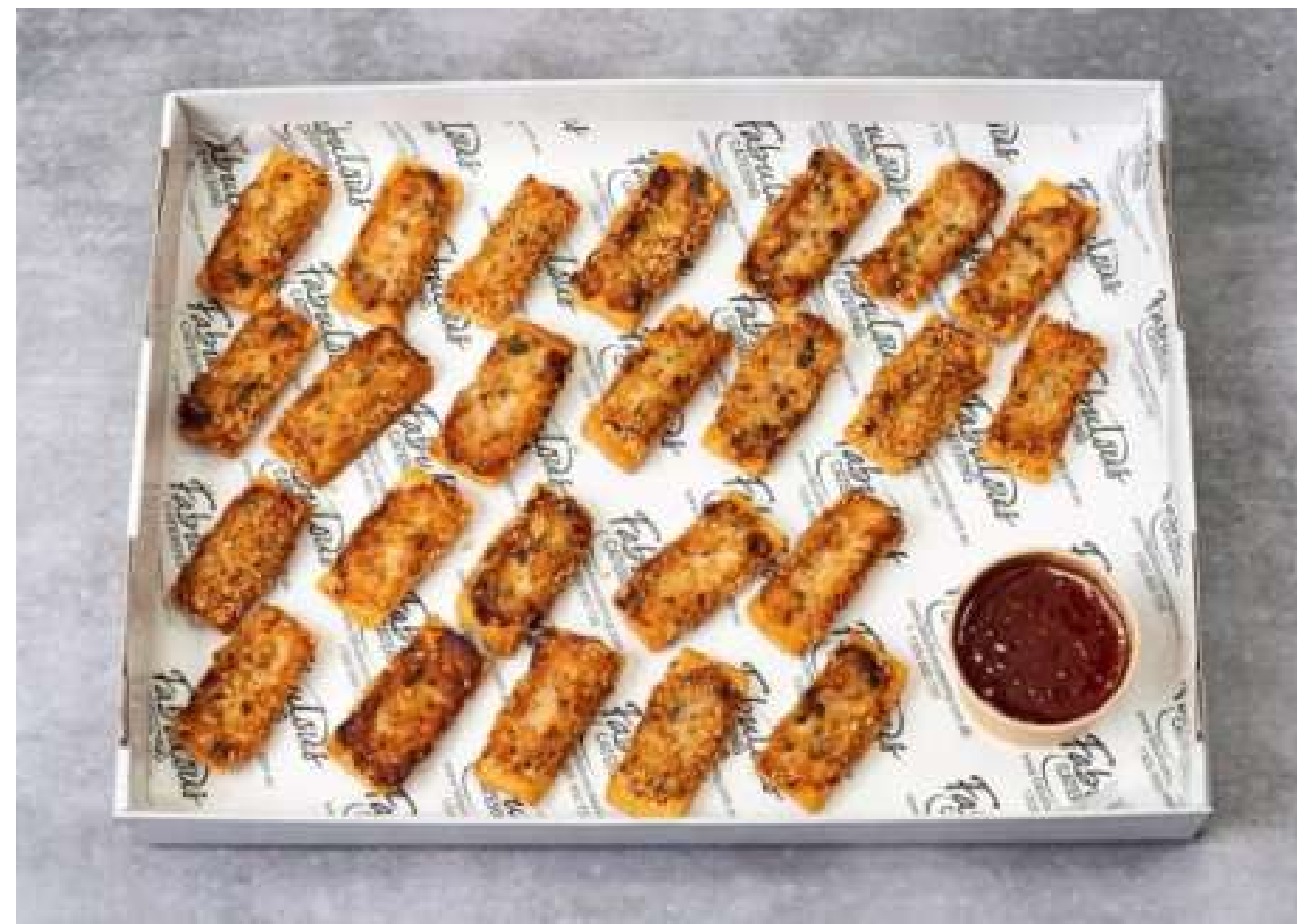
PRAWN TOAST PLATTER $95