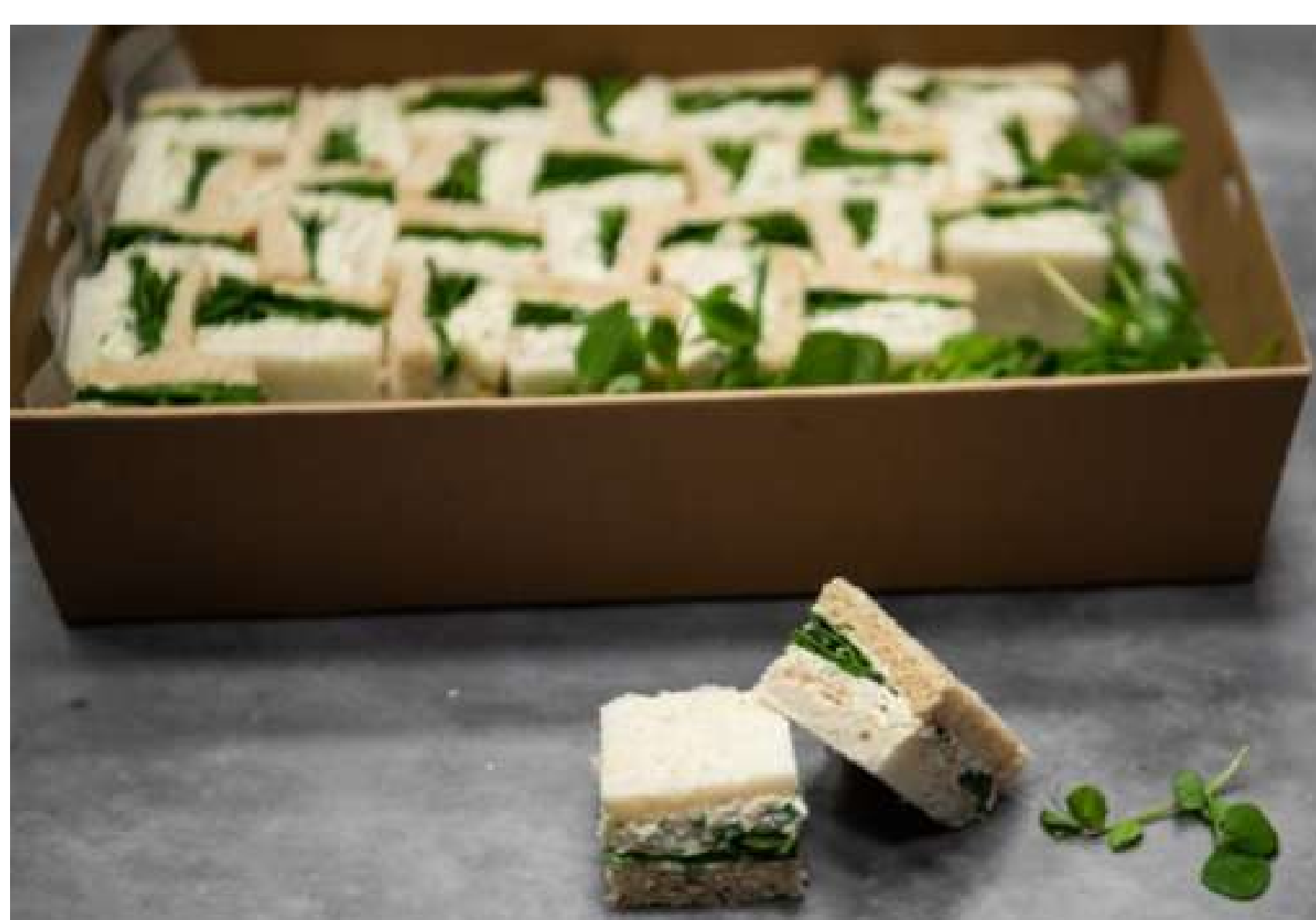
PILLOW SANDWICH $95

Corn fritters with caramelised onion and crispy bacon (24 pieces) - Vegetarian available on request