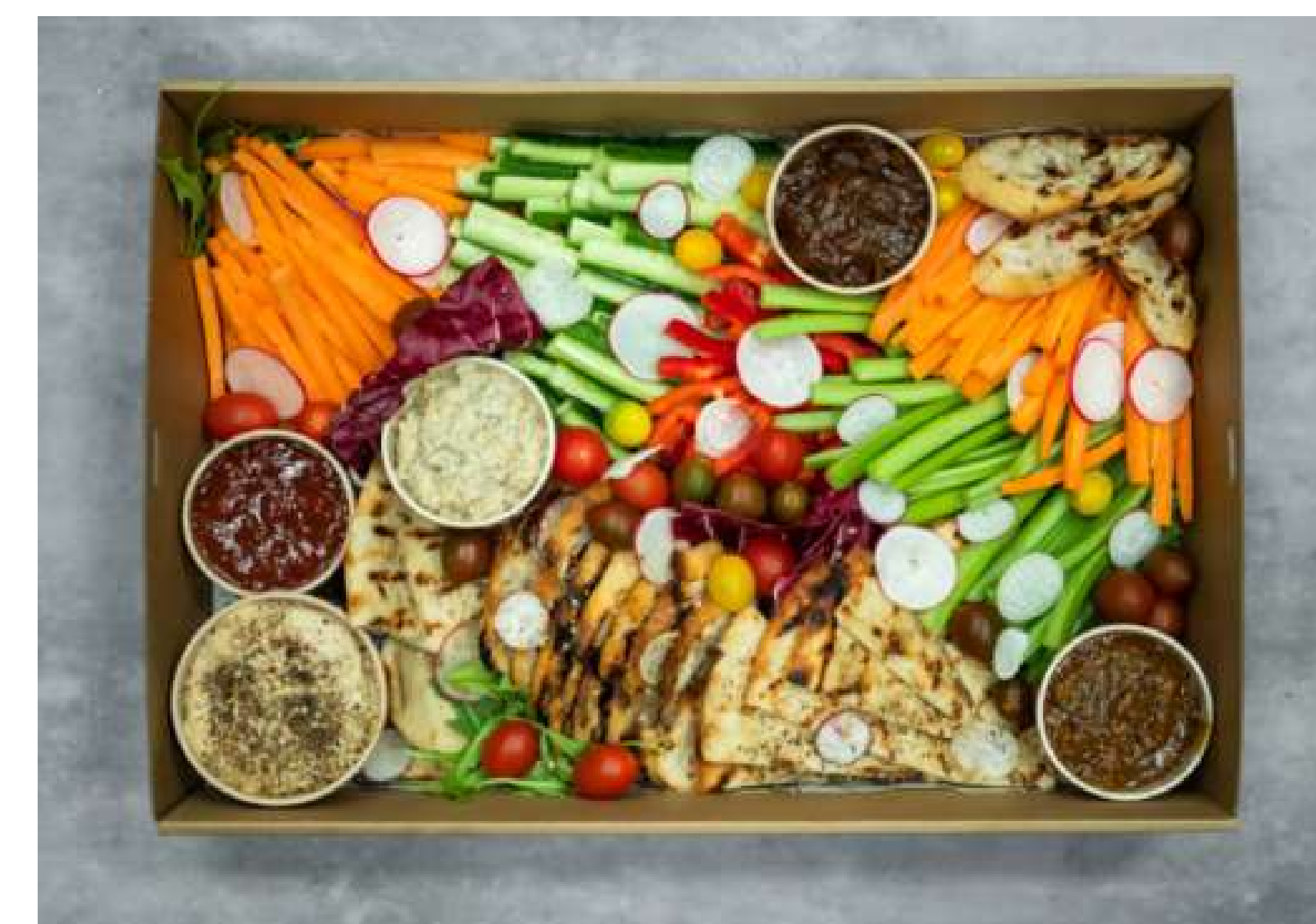
VEGETABLE GARDEN BOX $79

A selection of local cheeses and artisanal cheeses. Served alongside chutneys, quince paste, dried fruits, fruit loaf and grapes.