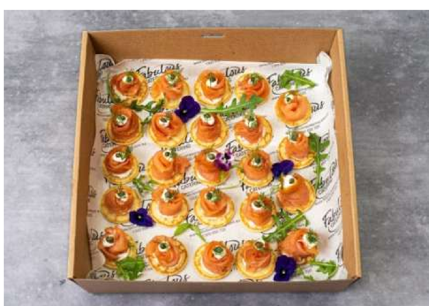
CURED SALMON $110

Cured salmon on mini pancake, citrus mascarpone (24 pieces)