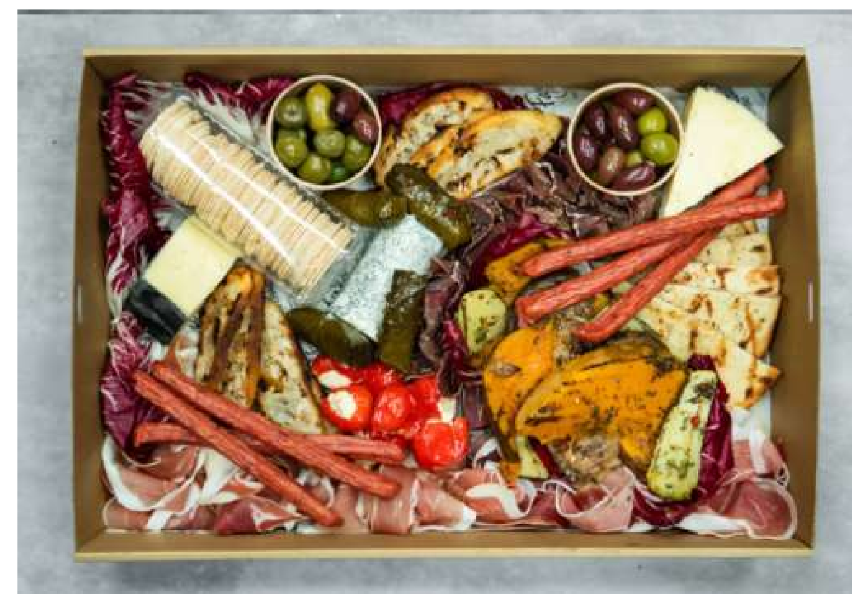
ITALIAN SELECTION BOX $129 - SERVES 10

A premium selection of tapas including garlic and herb marinated prawns, sautéed chorizo, jamon iberico and blue cheese. Served alongside traditional potato tortilla, butternut pumpkin, hummus and marinated olives with freshly baked bread and crackers.