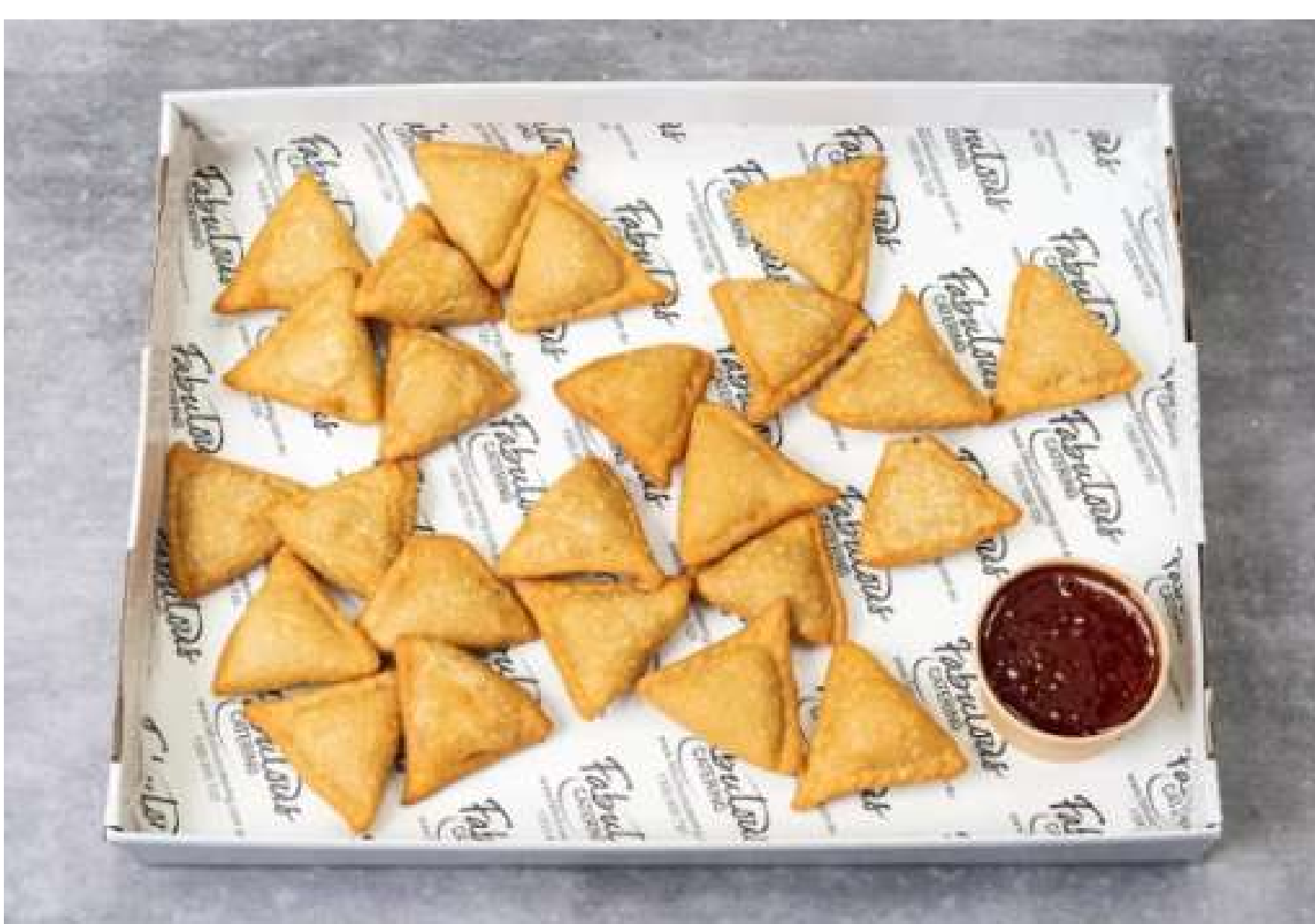
SAMOSA BOX $95