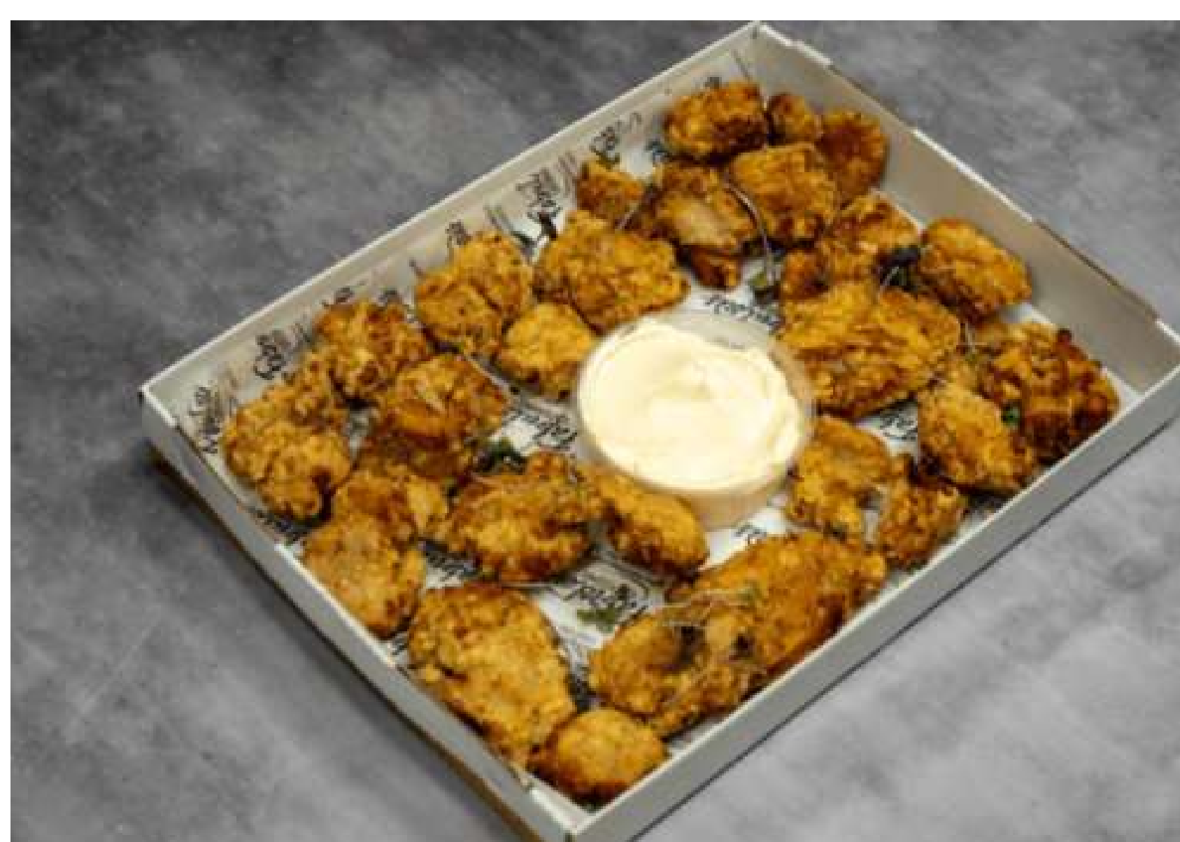
KARAGE CHICKEN BOX $95