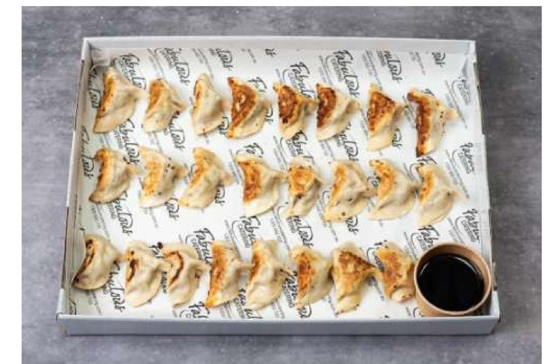
GYOZA BOX $95

Mac n cheese croquettes, harissa aioli (24 pieces)