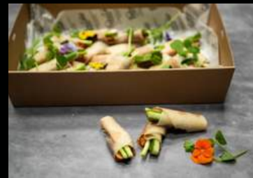
PEKING DUCK PANCAKES $120

3 varieties of chef selection bruschetta (30 pieces)