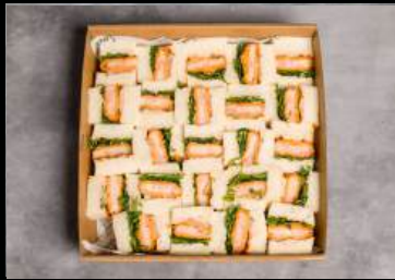
PRAWN SANDO $99

HANDCRAFTED CANAPES DELIVERED ALREADY GARNISHED AND READY TO SERVE