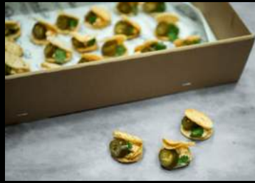
LEMON ZAATAR CHOOK $99

Crumbed prawn sando, bloody mary kewpie, arugula (24 pieces)