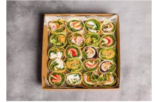
WRAP BOX $95

Selection of 20 assorted mini rolls with chef selection of fillings.