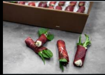
BEEF BRESAOLA $110

Lemon zaatar chicken, harissa yoghurt, pita (24 pieces)