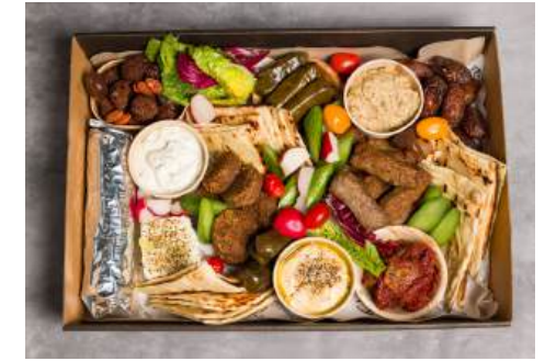
MIDDLE EASTERN PLATTER $129 - SERVES 10

Selection of cured meats, salami sticks, grilled chorizo, three dips, local cheeses, fruit, chargrilled vegetables, olives, pickles, baked bread and crackers.