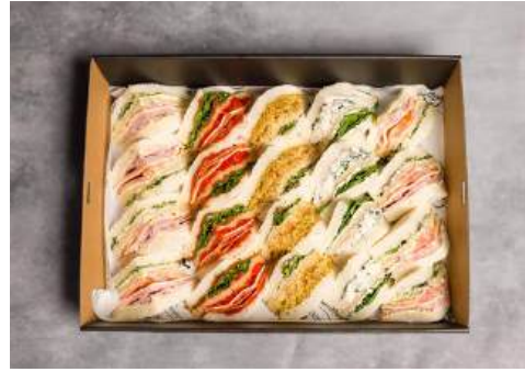
SANDWICH BOX $95

Selection of 20 pastries including pies, tarts and sausage rolls.