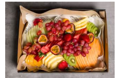
FRESH SEASONAL FRUIT PLATTER $89 - SERVES 15

Assorted selection salmon, chicken and vegetable nori, maki and nigiri pieces, with pickled ginger, soy and wasabi.