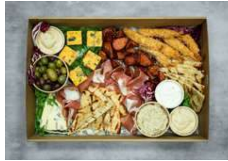
SPANISH TAPAS BOX $129 - SERVES 10

A traditional ploughman's style platter of roast beef, smoked chicken, roast ham alongside aged cheddar, boiled eggs, pickles and freshly baked bread.