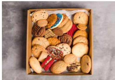
COOKIE BOX $80

20 assorted cookies and slices straight from the Fabulous kitchen