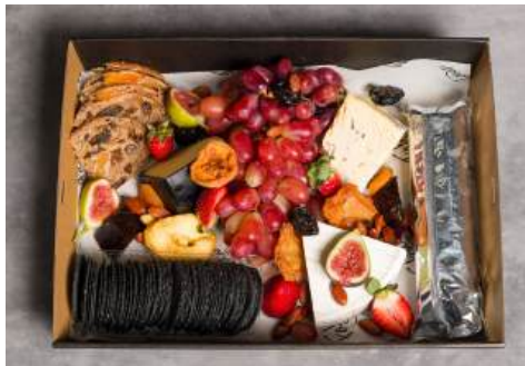
PREMIUM CHEESE SELECTION $99 - SERVES 10

An assortment of dips, stuffed vine leaves, lamb kofta, falafel, dried fruits, pickles, marinated Persian feta, baked flatbread and crackers.