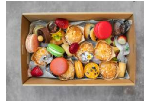
SWEET TREAT BOX $105

25 assorted petit fours and sweet treats including truffles, macarons and mini cakes.