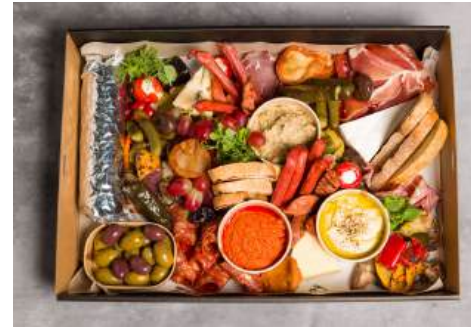
ITALIAN SELECTION BOX $129 - SERVES 10

Box includes a selection of cheese filled piquillo peppers, rice balls, chorizo, crispy prawns, three dips, beef pinchos, frittata, jamon, manchego cheese, olives, baked bread and crackers.