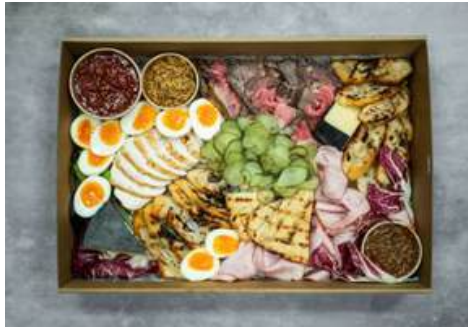
PLOUGHMANS PICNIC BOX $129 - SERVES 10

A traditional ploughman's style platter of roast beef, smoked chicken, roast ham alongside aged cheddar, boiled eggs, pickles and freshly baked bread.