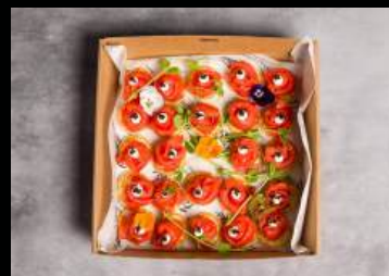
CURED SALMON $110

Corn fritters with caramelised onion and crispy bacon (24 pieces) - Vegetarian available on request