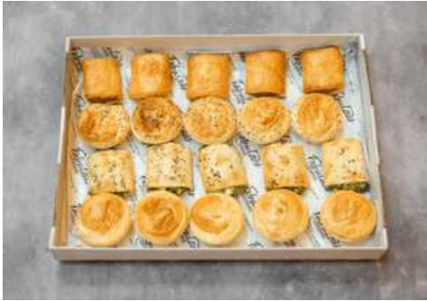
SAVOURY PASTRY BOX $95

Selection of 20 pastries including pies, tarts and sausage rolls.