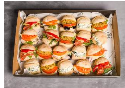
ROLLS BOX $105

Selection of 20 double-layer sandwich points with chef selection of fillings.