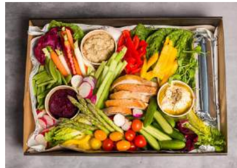
VEGETABLE GARDEN BOX $79 - SERVES 10

A selection of local cheeses and artisanal cheeses. Served alongside chutneys, quince paste, dried fruits, fruit loaf and grapes.