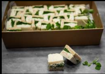
PILLOW SANDWICH $95

Beef bresaola, ricotta, lemon and herbs (24 pieces)