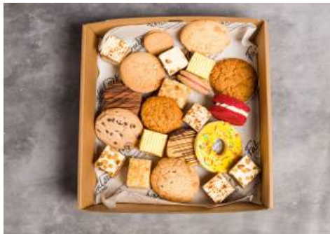
COOKIE AND SLICES BOX $85

20 assorted cookies and slices straight from the Fabulous kitchen