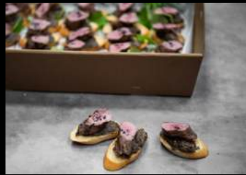
LAMB FILLET CROSTINI $120

Peppered lamb fillet crostini, truffled mushroom pate (24 pieces)