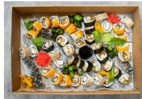
SUSHI BOX (48 PCS) $120

Market vegetable box including assorted dips, quakes, asparagus, sugar snaps, rainbow carrots, truss tomatoes, capsicum, baked breads and crackers.