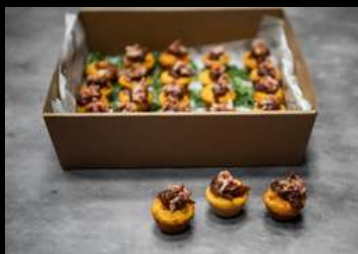
CORN FRITTERS $140

Peking duck pancakes, hoisin, spring onion, cucumber (24 pieces)